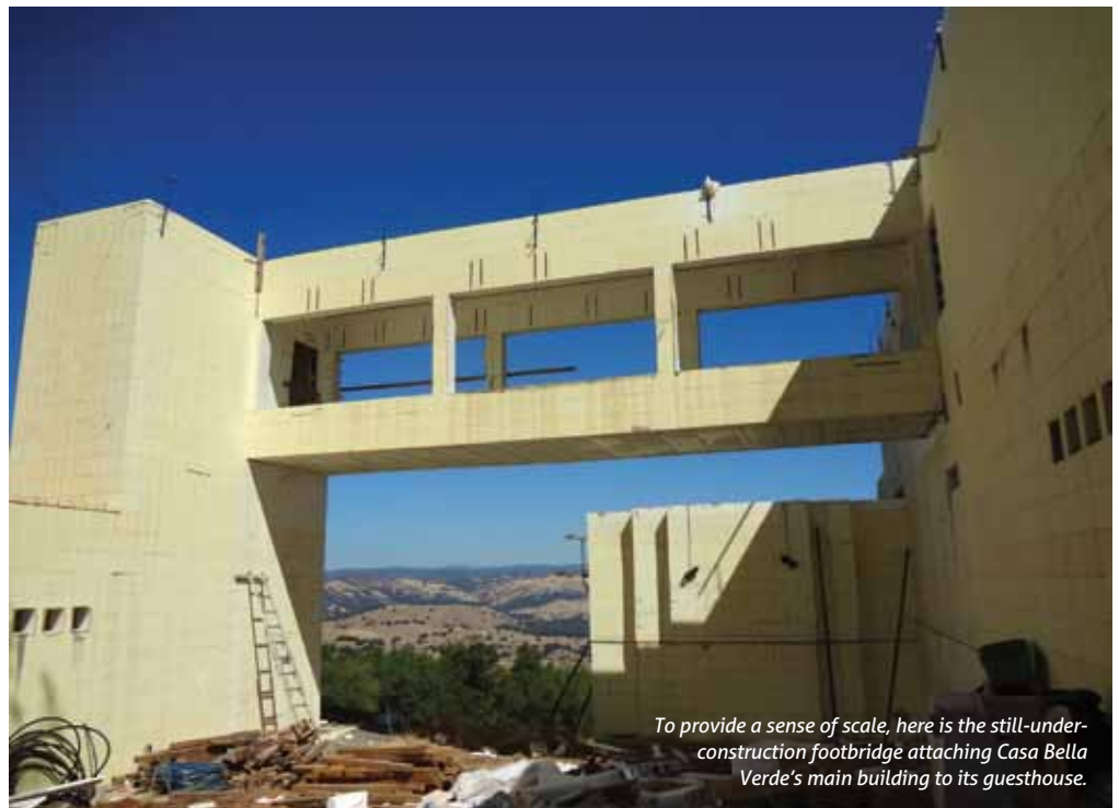
To provide a sense of scale, here is the still-under-construction footbridge attaching Casa Bella Verde's main building to its guesthouse.