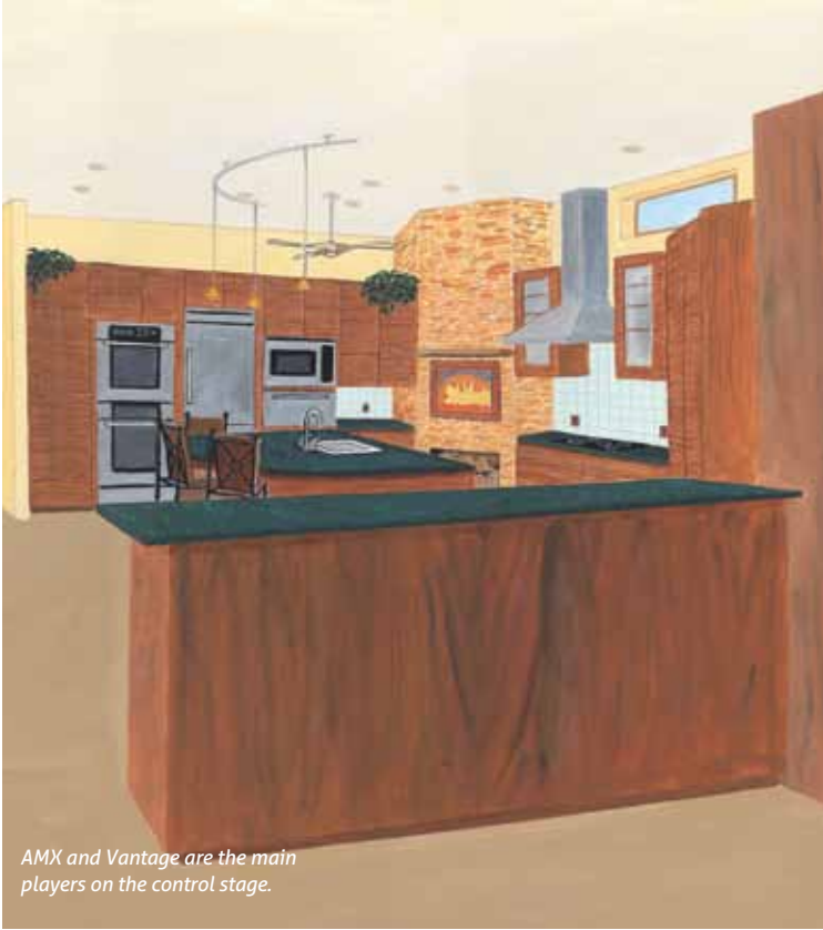
AMX and Vantage are the main players on the control stage.

Polk loudspeakers were spread across the home's interior and exterior; Liberty's premium, ExtraFlex 14\4, 105-strand cabling brings them all home to Middle Atlantic racks in a basement-dwelling main control room. Beyond the high strand count (loudspeaker cabling can commonly come in at a high count of 65 strands from some manufacturers), the oxygen-free copper (OFC) design of the Liberty wire greatly reduces the number of copper crystals encountered by audio signals traveling its pathways, thereby removing barriers that degrade sound.